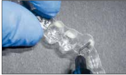
Application of AlignerFlow LC into the template