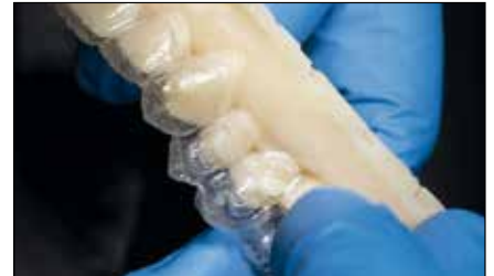
Removal of the template after light polymerisation