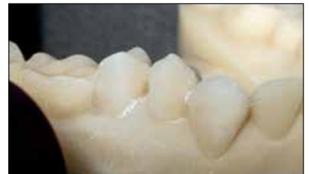
Final situation after removal of all residues