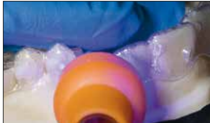
10 sec light-curing through the transparent template