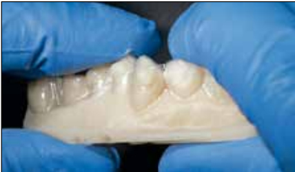
Template put into place