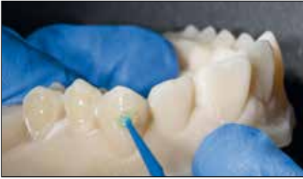
Preparation with standard etching and bonding protocol