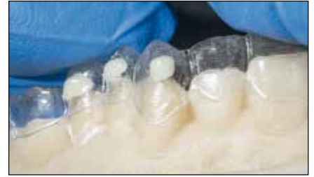
Insertion of the template