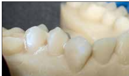
Treatment completion: residues are visible under UV-A light