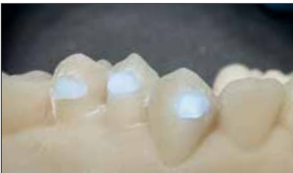
Finished attachments under UV-A light